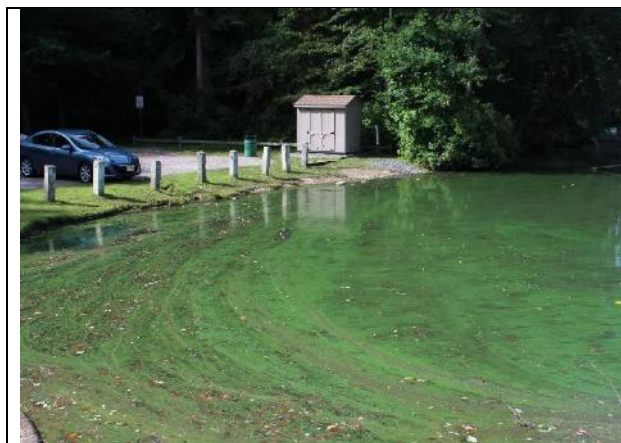
Green streaks parallel to shoreline