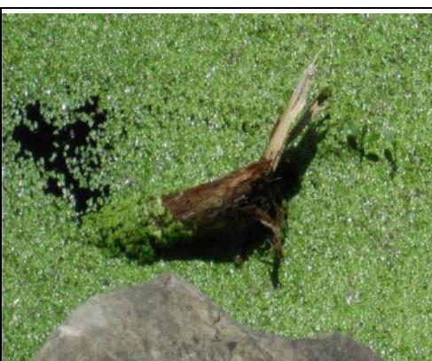
Duckweed (a tiny floating plant with true leaves)