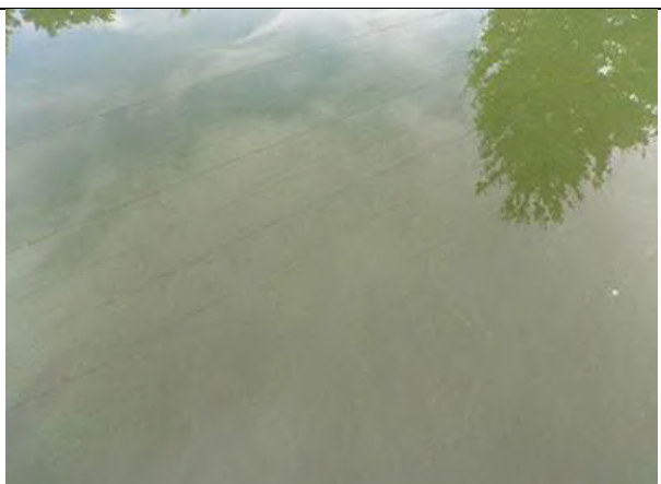
Large green dots