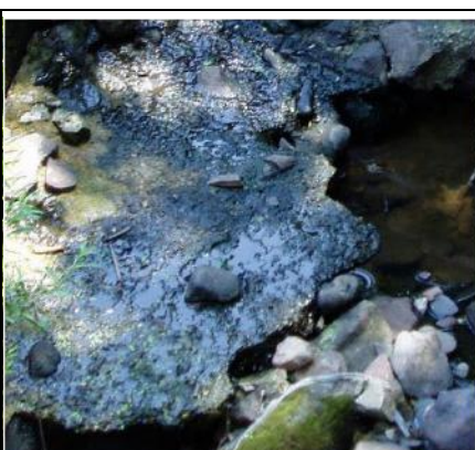
Muck (a mixture of organic material on the surface or banks)